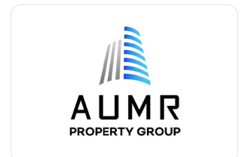
Leasing Team (07) 3154 5707