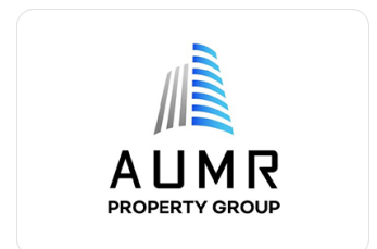
Leasing Team (07) 3154 5707