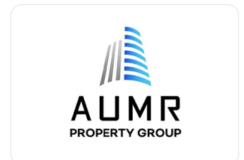
Leasing Team (07) 3154 5707