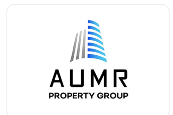
Leasing Team (07) 3154 5707