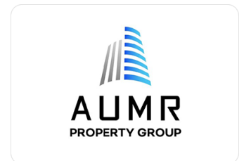
Leasing Team (07) 3154 5707