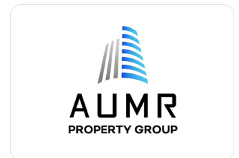
Leasing Team (07) 3154 5707